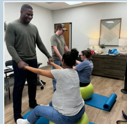
Two couples gathered at our Leon Springs office to prepare for the incredible journey of childbirth and parenthood.

Here is just one comment by a mom surveyed. "Honestly I can't give feedback on how to make an experience better all I can do is thank everybody at this clinic for making me and my mom feel very comfortable and welcome. I am expecting my first baby [and] the process can be very scary but arriving at this clinic and having everybody greet us and in such a great mood put us at ease and we were able to enjoy the whole process of the sonogram. I truly want to say thank you from the bottom of my heart for beginning the journey of having my first child on a very good note. Again thank you so much to everybody there that day for making me feel special and very comfortable."