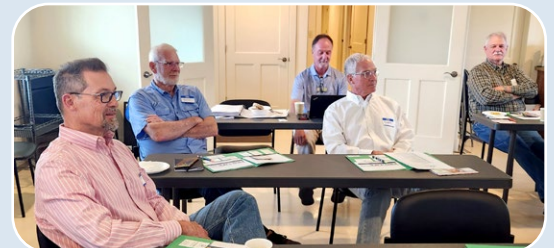
Training for Ultimate Fatherhood: 10 new dad advocates!