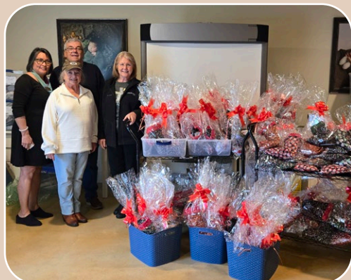
Hill Country Council for the Arts