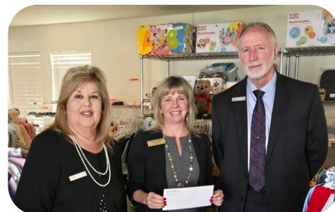
Bank of America in Boerne came for a tour and gave HCPC a gift!